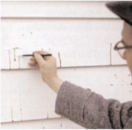
▲ Extractives from blisters

ammonia, as the fumes can be harmful or fatal.) After washing the siding, rinse it with clear water and let it dry.