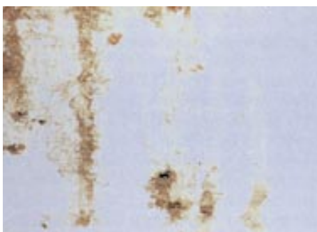
▲Run-down extractive stain

Iron stains are also black in appearance and may be associated with nail or fastener corrosion or may be more diffuse in nature. Using a two-part diagnostic solution of 19% hydrochloric acid followed by a 12% aqueous solution of potassium