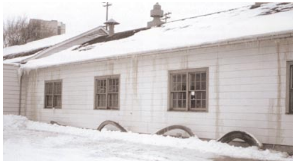
Extractive bleeding resulting from ice dams ▼