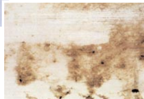
▼Diffuse extractive siding

boards that may be prone to staining, often identifiable by the dark colors and possible dark lines that appear with the grain. Divide a board into six inch (minimum) test areas. Coat each of the test areas with one coat of the primer to be tested applied at its